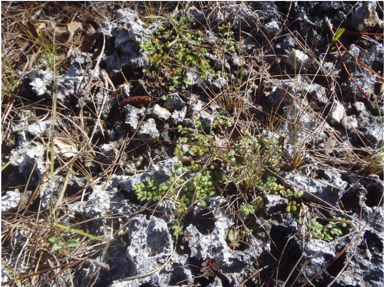
Image 1. The federally and Miami-Dade county endangered Goulds sandmat ( Euphorbia deltoidea ssp adhaerans )

In 2012, the qualifying forest factors for the tax incentive and NFC program were incorporated into an updated quantitative evaluation form adopted by the Board of County Commissioners. Factors are presence of listed or endemic species, biodiversity, forest structure, forest size, habitat values, geology, and cover of exotic species. Additionally, the County code contains evaluation criteria used to nominate land to the EEL acquisition list. The criteria for evaluating the resource consists of biological value; vulnerability to degradation or destruction; the requirements (costs) for managing natural attributes; and the feasibility of meeting management requirements.